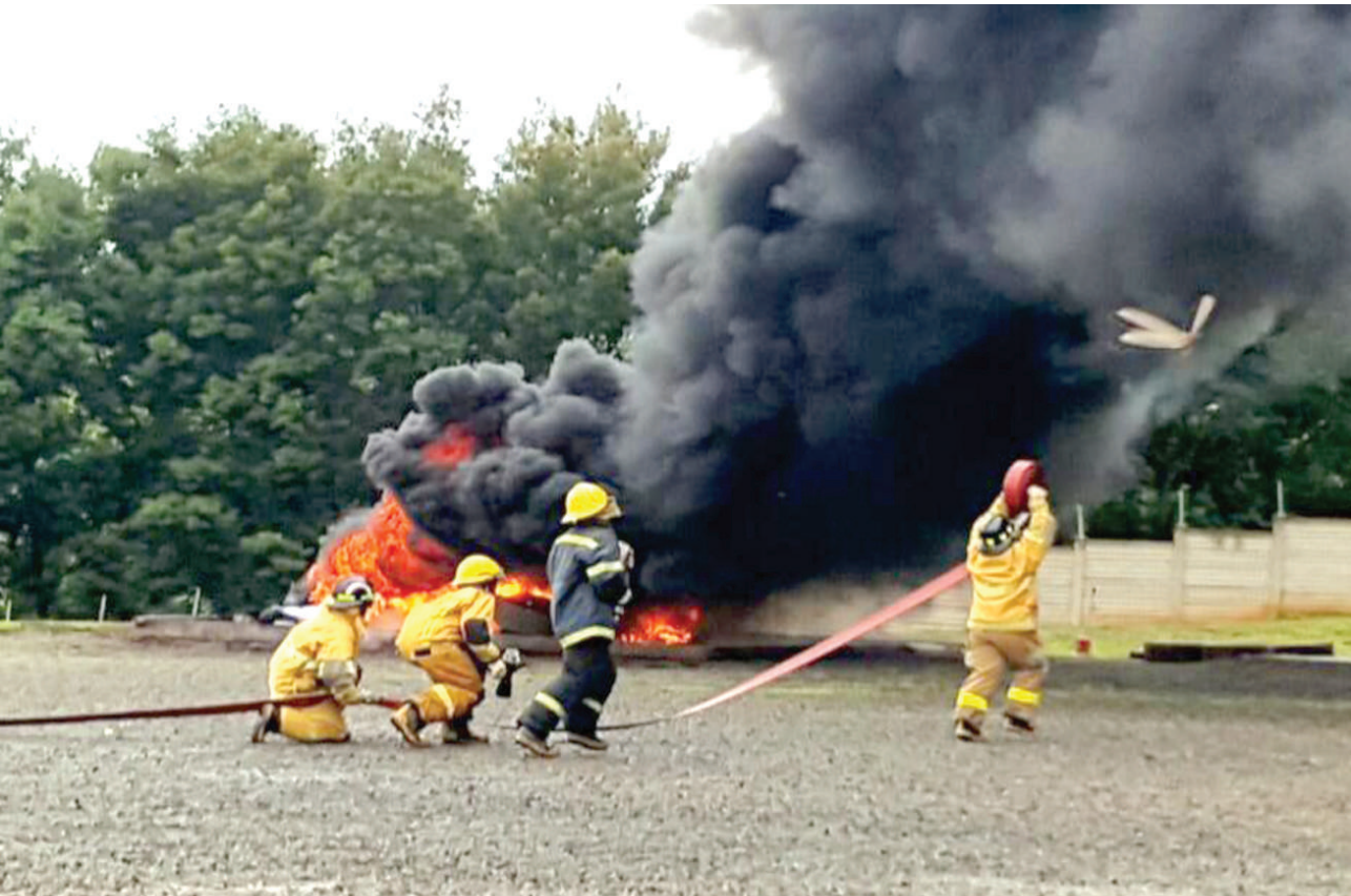
Firefighting Pass-out Parade Grey-town

The District through the assistance of the District Human Resources Unit received funding from the LGSETA towards an accredited training on Fire fighting. A total of four (4) learners sourced from Local Municipalities were accepted for such training however only 3 have completed the training and were placed at Ray Nkonyeni services.