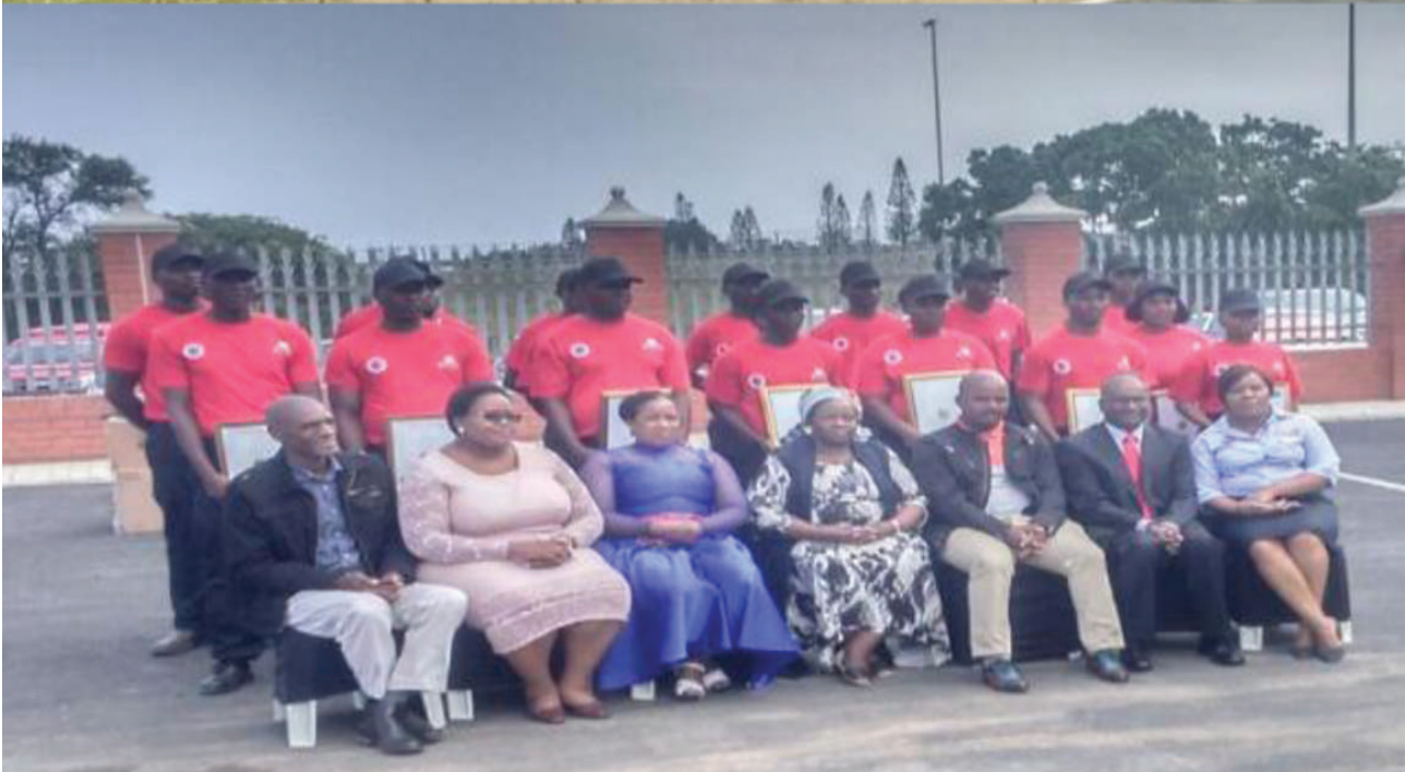
UGU certificate handover ceremony