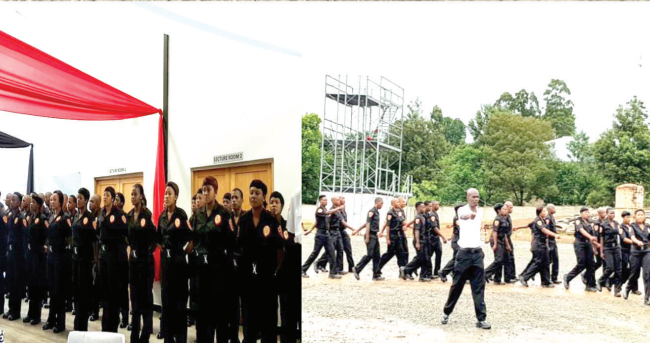
Ugu District Certificate Handover Ceremony