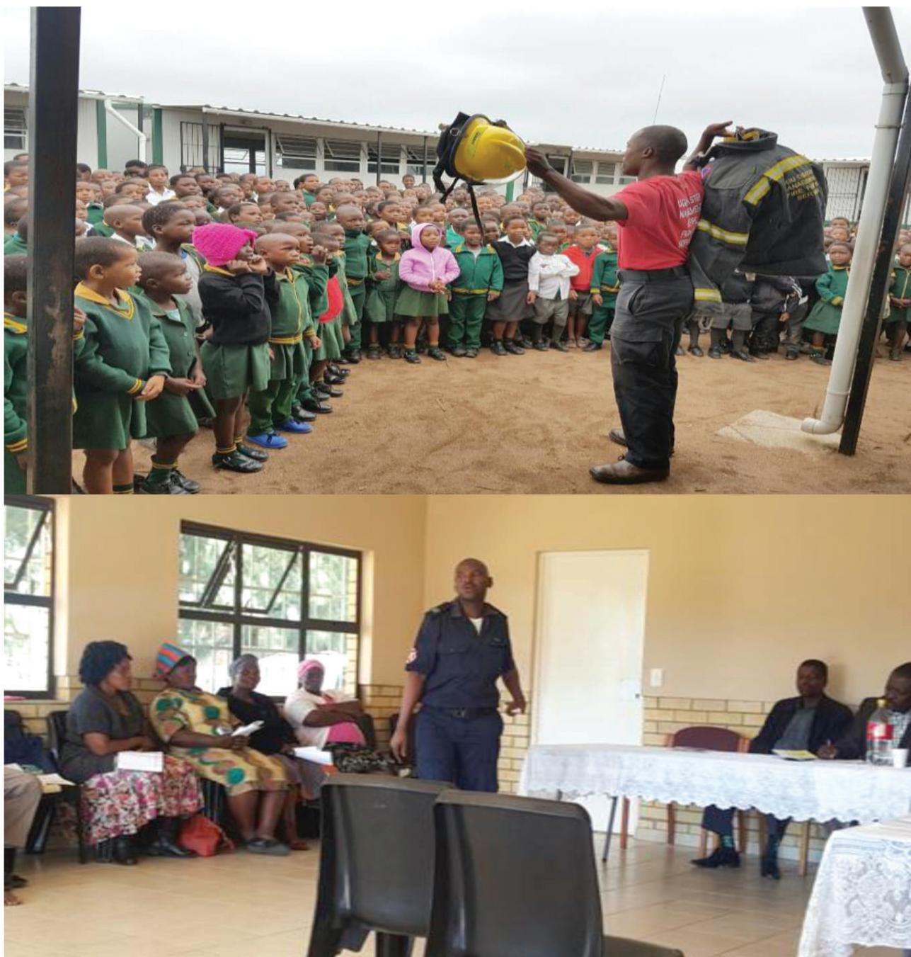
Disaster management workshops